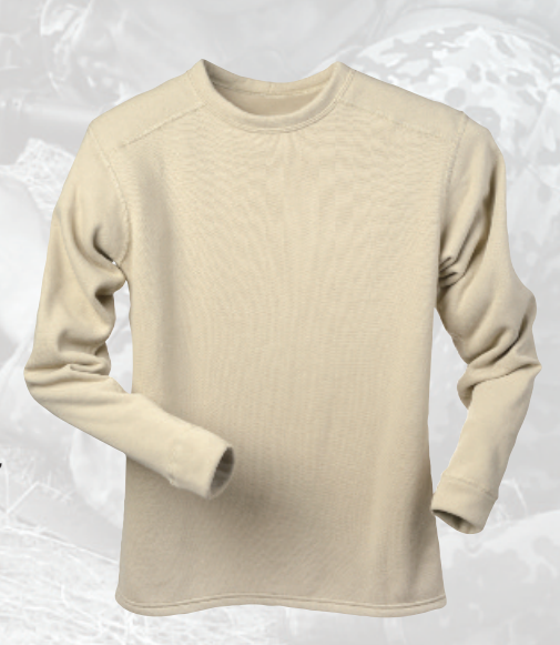
A14F101 FR4 Long Sleeve Crew Color: desert sand. Also available in tan 499, or coyote brown. Sizes: S-2XL