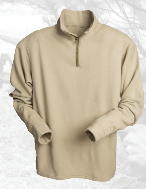
A14F102 FR4 1/4 Zip Top Color: desert sand. Also available in tan 499, or coyote brown. Sizes: S-2XL